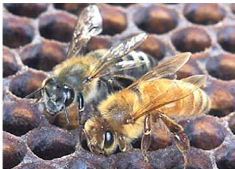
Africanized Bee (left) European Honey Bee (right)

It is hard to distinguish the physical differences between a Western and Africanized honey bee besides its behaviors.